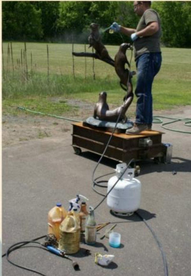
Almost ready for the trip to Winona.