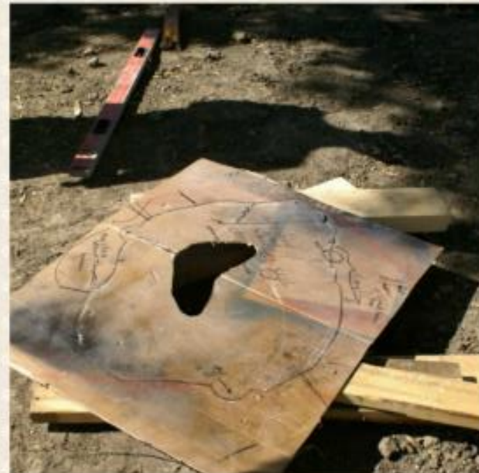
Laying out the site takes a lot of coordination, ...