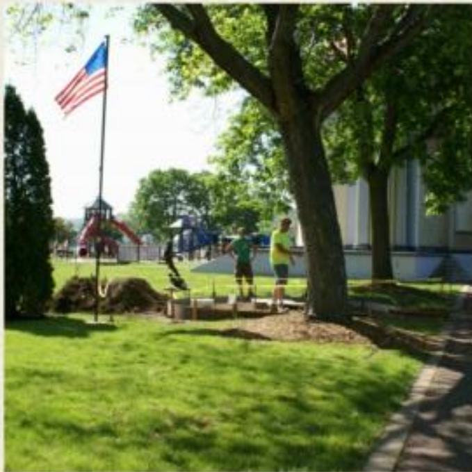
This will be the otters' new home.